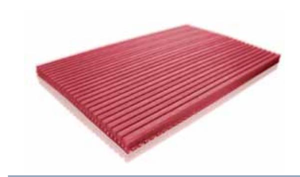
QualiFlex CrestT - Reliable performance