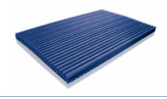
QualiFlex CrownT - Reach the next level

Conventional press sleeves show strong reactions to harsh conditions and suffer often from hydrolysis, higher wear and reduced void volume. Compared to conventional press sleeves QualiFlex CrestT and QualiFlex CrownT are especially designed for tissue applications. Real examples have shown very good results, such as up to 2% dryness increase after press, reduced abrasion by 50%, or a constant production output over the entire lifetime. This makes QualiFlex a trusted product for tissue production throughout the world!