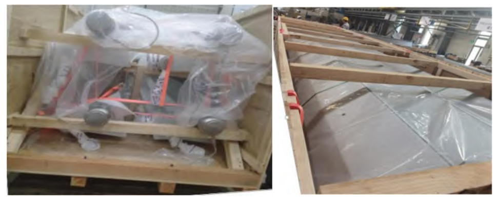
Figure 10, 11: Final assembly of box according to VN 1577-1

With the selection of GK 4 and usage of VCI foil please ensure an air tight closure for a proper function of the foils corrosion inhibitor! Air tight coverage with aluminum foil should not be used without appropriate amount of drying agent inside for a sufficient corrosion protection!