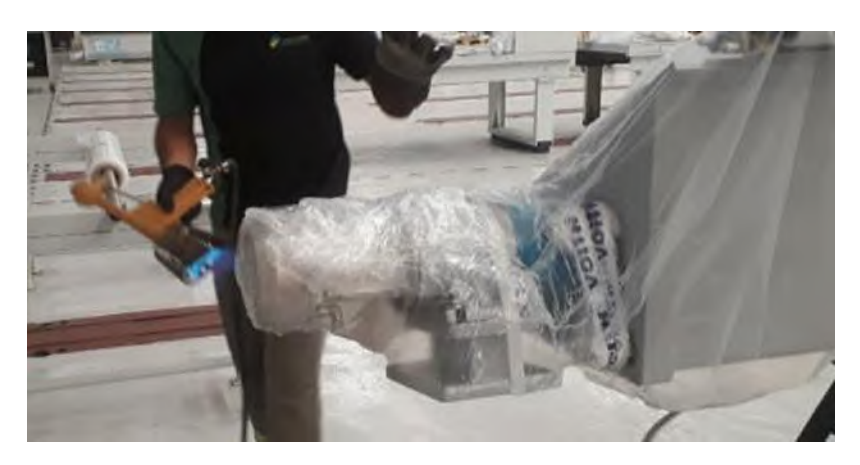
Figure 4: Example for protection in the bearing area with shrink foil