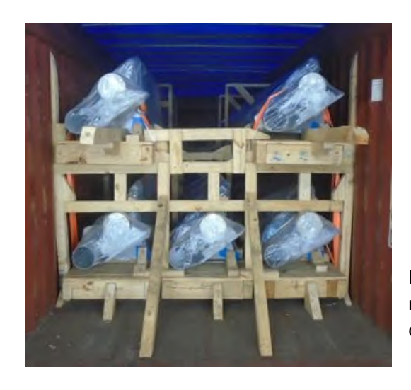
Figure 15: Example of packaging and securing multiple components on top of one another in the container without separate crate