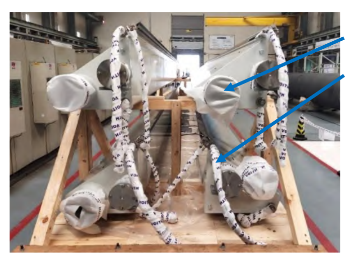
Figure 7: Example for wood pallet with frame