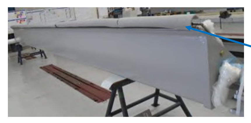
Figure 3: Example for protection in the blade area

Protection against damage must be provided especially in the area around the blade and the bearing.