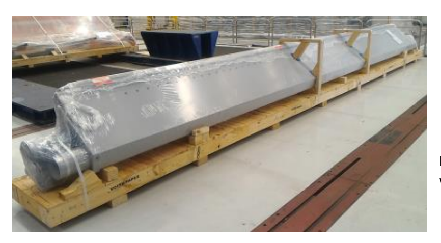
Figure 6: Example for storage on a wooden floor

For VK 5, at least a floor in accordance with VN 1577-1 must be used. The need to use a crate and/or its design in accordance with VN 1577-1 must be decided by the contractor and agreed in consultation with the purchaser.