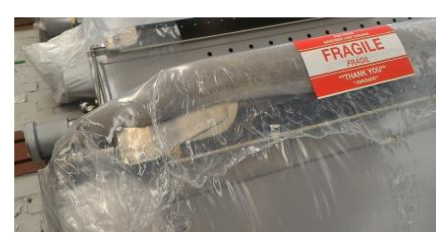
Figure 5: Example for specific marking of sensitive areas

Specifically sensitive areas must be specially marked in order to prevent accidental damage due to contact.