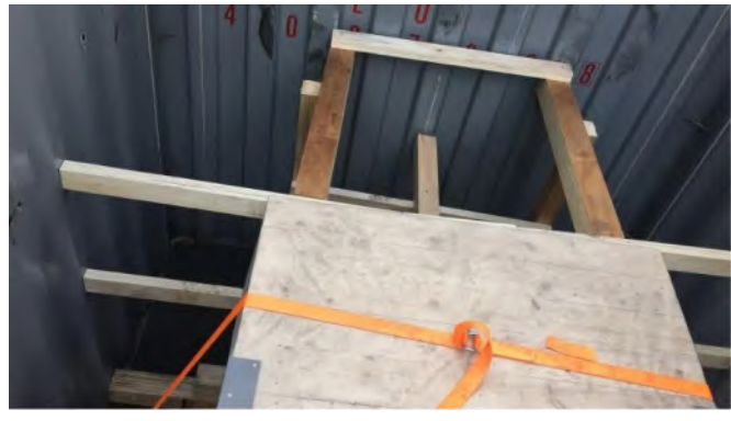
Figure 13, 14: Example of fixation crate in container