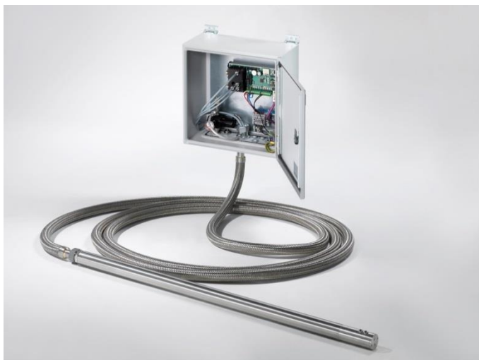
Caption 1: With WebDetect-nx, Voith has developed a new solution that identifies web breaks in paper production in a more reliable and fail-safe manner.