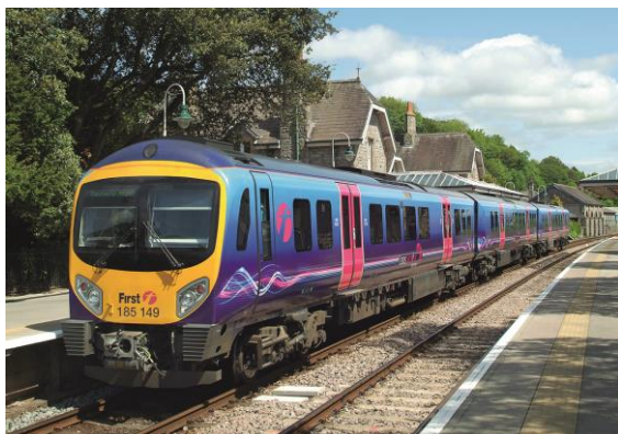
Class 185 diesel railcar operated by First TransPennine Express with Voith RailPack

Voith sees its Service Centre as an extremely important site for sales and service for rail vehicle components. Voith Rail Service employees apply their expertise on a daily basis and not only restore the quality and reliability of the components during maintenance but also further develop and improve them.