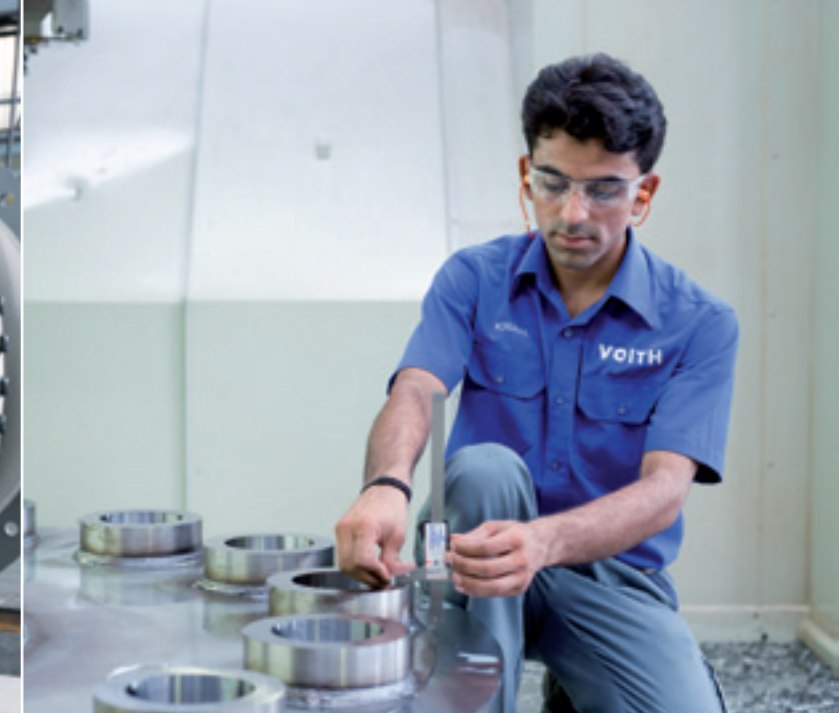
State of the art high precision turbine components.