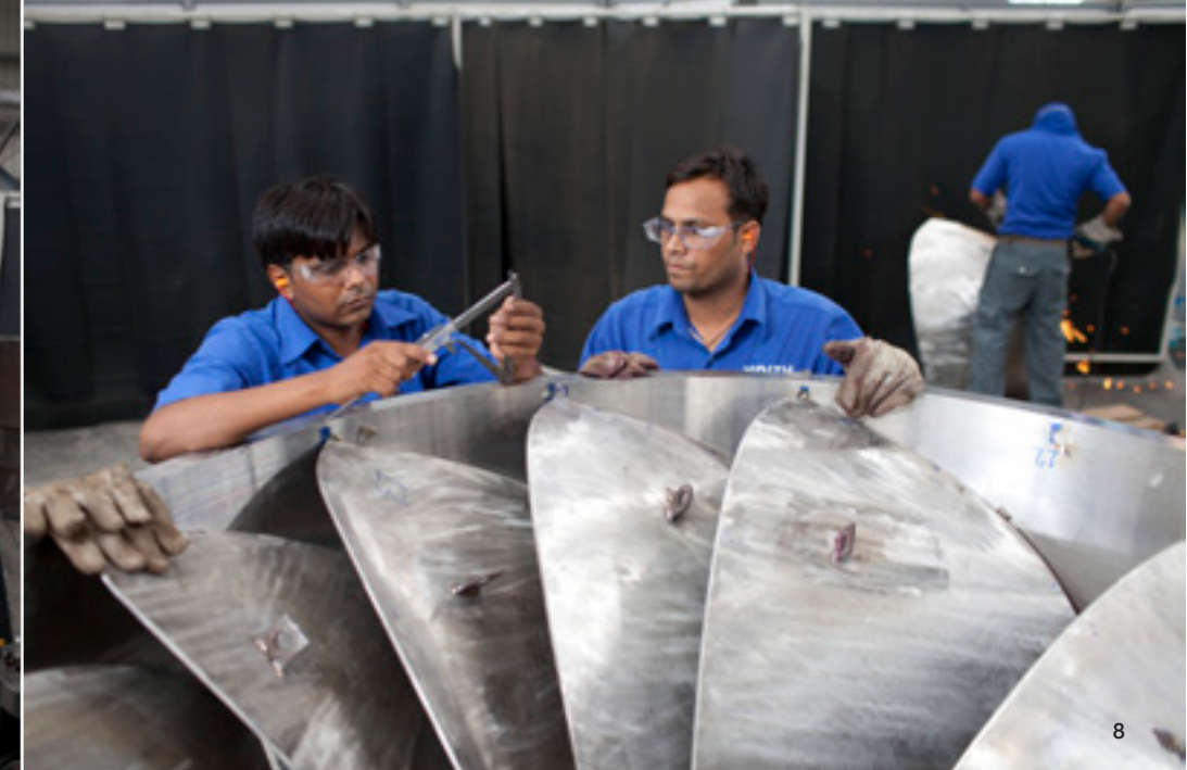
1-8 Manufacturing Facility Vadodara, India