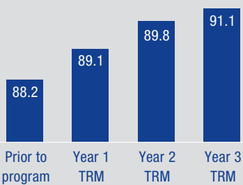
Paper machine efficiency [%]

Case study 2 result: – Reduction in annual roll spending – 3% increase in machine efficiency