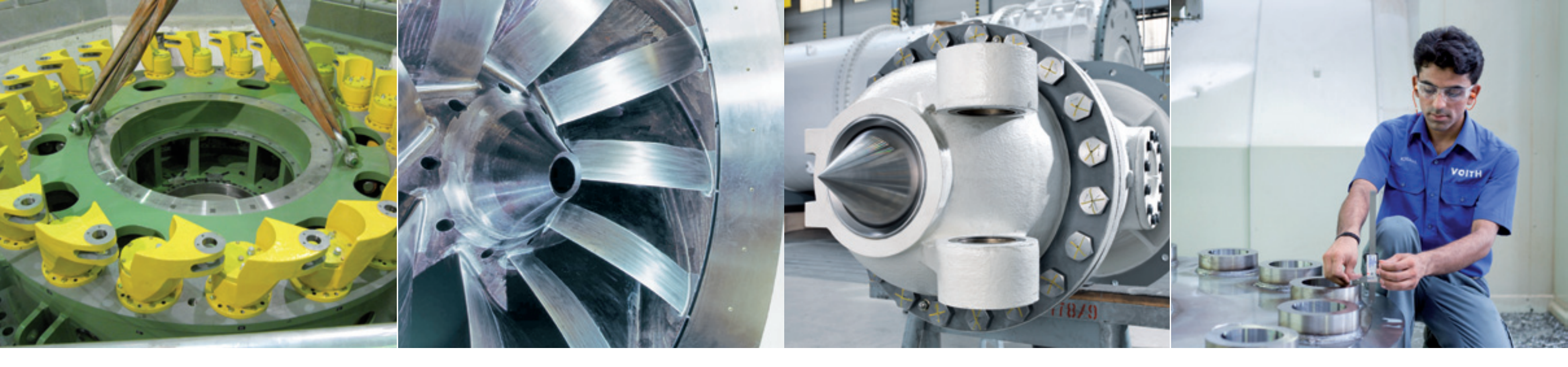
State of the art high precision turbine components.