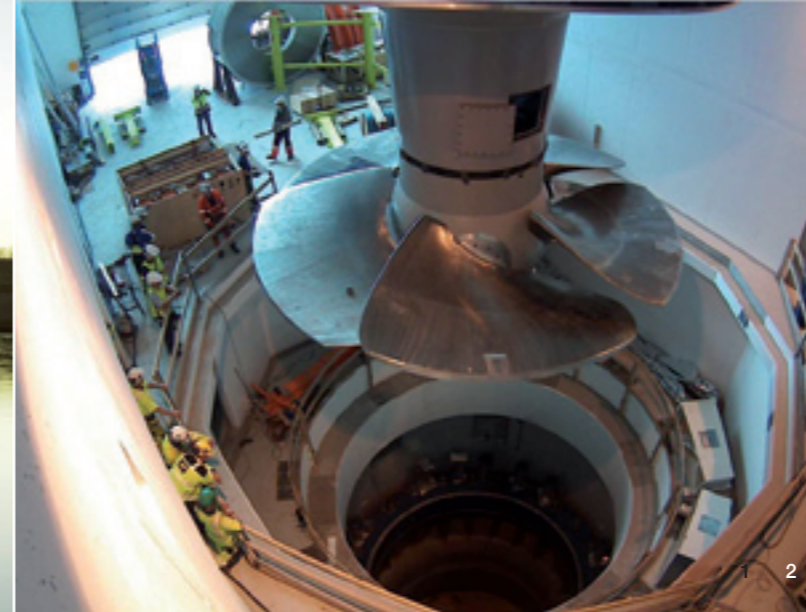
Cover picture Estreito, Brazil