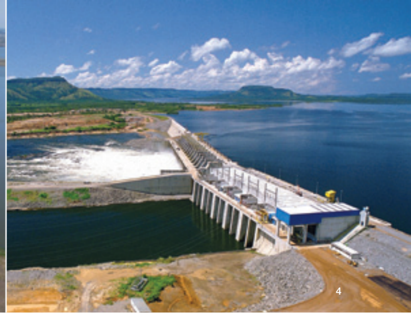
1 PeixeAngical, Brazil 2 Budarhals, Iceland 3 Yacyreta, Argentina 4 Lajeado, Brazil