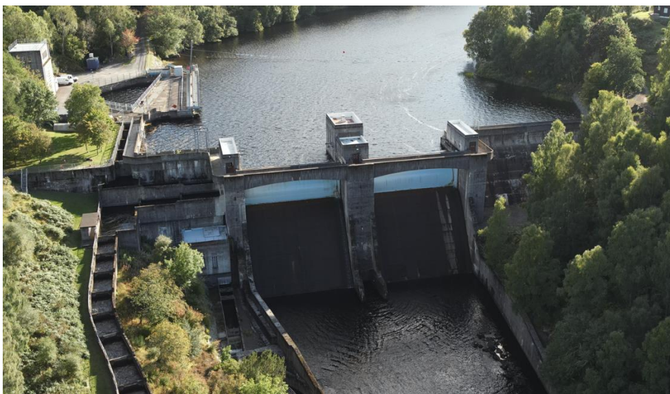
Drone view of a hydropower dam