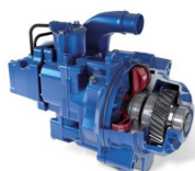
Caption: The Aquatarder SWR brakes with water.